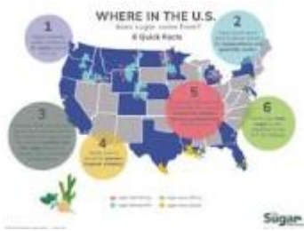
Where Does Sugar Come From?